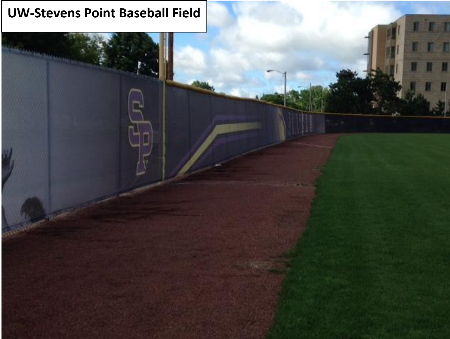
UW-Stevens Point Baseball Field