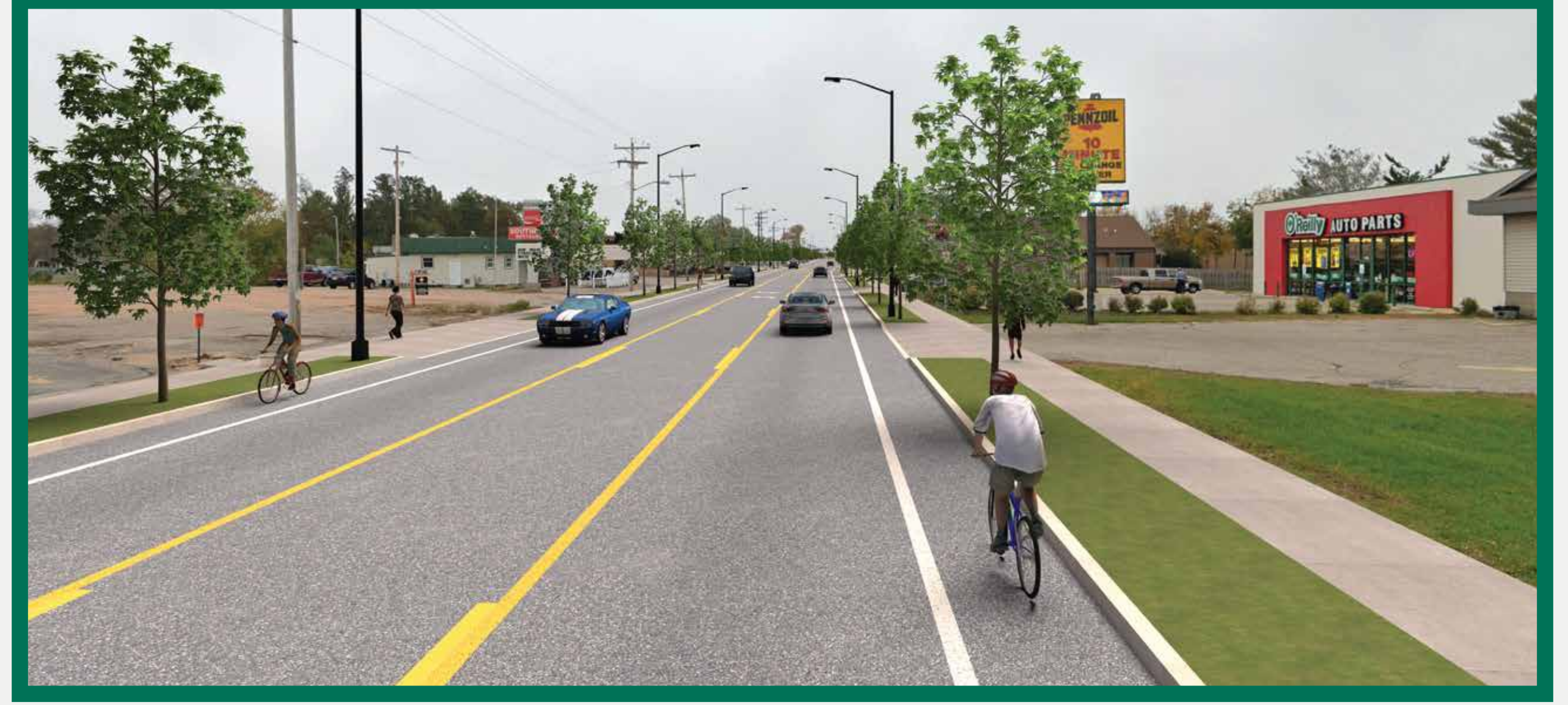
Location: south of Rice St.